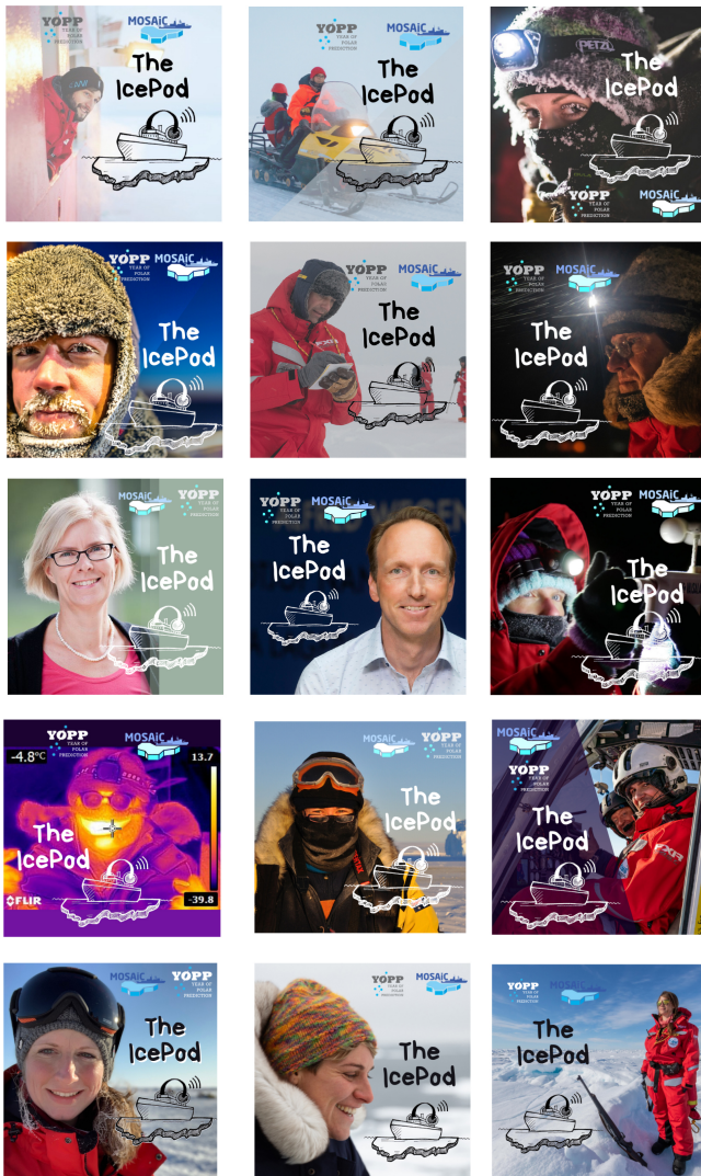
Figure 1. By early 2021, 10 full episodes, four bonus episodes and one live episode of the Year of Polar Prediction podcast The IcePod were produced.

2017). In a general effort to enhance communication and knowledge transfer for the Year of Polar Prediction, the podcast has put a personal face to polar research to make a close connection between science and society.