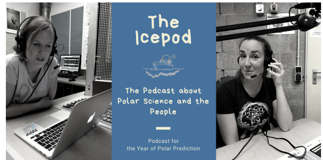
Figure 2. The IcePod is produced in cooperation with Radio Weser.TV Bremerhaven.